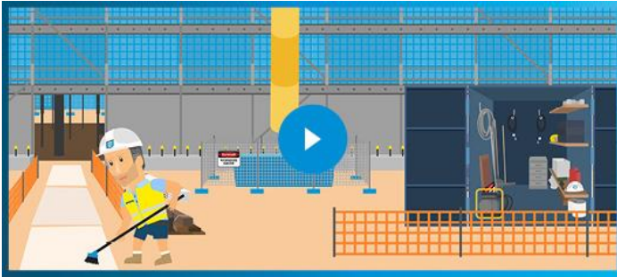
1 / HOUSE KEEPING